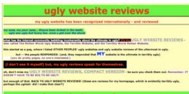
Screen capture copyright: http://thebiguglywebsite.com/reviews

The site design will convey the importance and authority of your business through its design. Below are two examples of design: